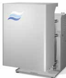
a Housing (optional) with easy access for maintenance