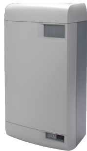
WH-D In-Duct Electrode Steam Humidifier