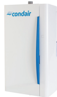
HumiLife RH In-Duct Whole-home Steam Humidifier

Connectivity for backend monitoring, service, and remote setpoint control