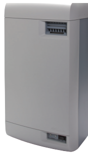
WH-S In-Space Electrode Steam Humidifier